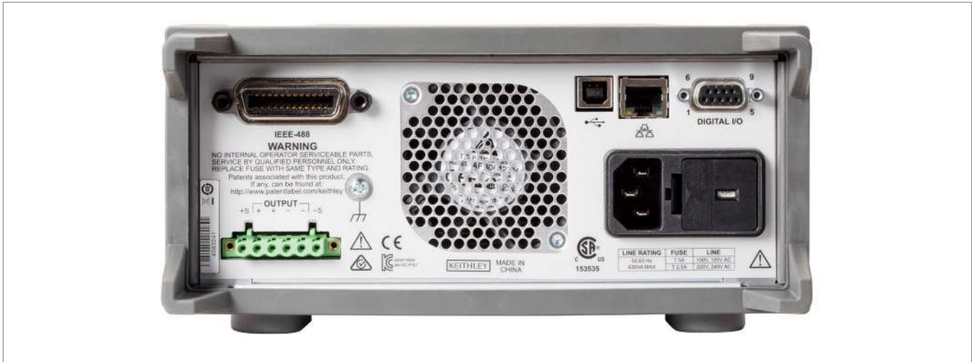
Figure 7. 2281S rear panel.

controlled via their built-in GPIB, USB, or LAN interfaces. The USB interface is test and measurement system (TMC) compliant. The LXI Core compliant LAN interface supports controlling and monitoring a Series 2281S supply remotely, so test engineers can always access the power supply and view measurements, even if located on a different continent than the test systems.