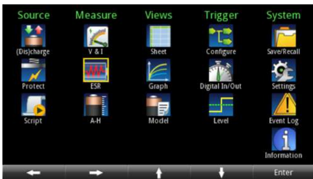
Figure 6. Battery test menu.

The bright, 4.3-inch TFT display shows voltage, current, and amp-hour readings, source settings, and many additional settings in large, easy-to-read characters. The icon-based main menu provides all the functions users can control and program for fast access to source setup, measurement setup, display formats, trigger options, and system settings. Menus are short, and menu options are easy to find and are clearly described, enabling test parameters to be setup quickly by using the navigation wheel, keypad, or soft-keys. Many setup parameters, such as voltage and current settings, can be entered directly from the home screen. Less complex tests don't require access to the main menu to make adjustments – just use soft keys on the home screen. Whether test requirements are simple or complex, the Series 2281S supplies provide a simple way to set up all required parameters.