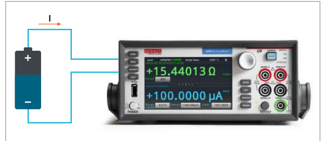
Use a Keithley 2450 or 2460 Series SMU with a model generating test script to discharge batteries and create battery models for the 2281S-20-6 Battery Simulator.