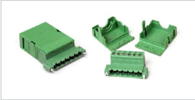
2280-001: Rear Panel Mounting Connector and Cover (assembled view on the left, and connector and top and bottom cover shown separately on the right)