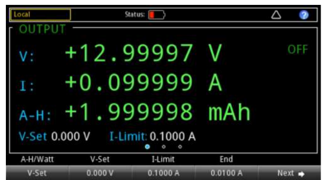
Figure 4. Battery test display.

After the test, a battery model can be generated based on the measurement result of the battery charging process. A battery model can be edited, created, imported, or exported in a CSV file format.