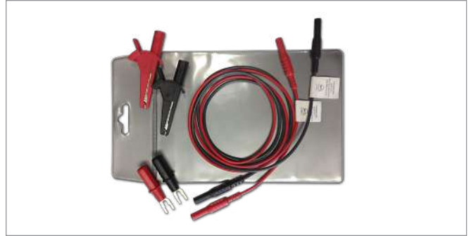
2280-TEST-LEAD: Power Supply Test Lead Kit, 1000 V, 20 A Rating: Contains 122 cm (4 ft) of cable, spade lug adapters, and alligator clips