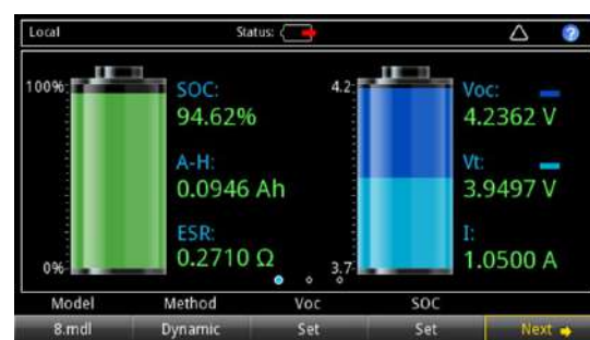
Figure 2. Battery simulator home screen.