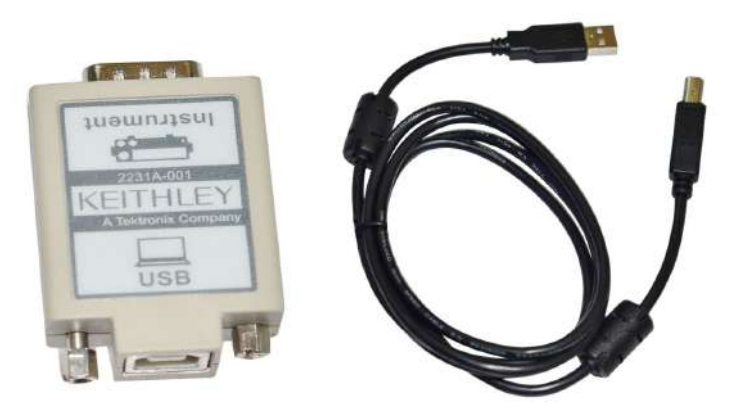
Figure 1: Model 2231A-001 USB Adapter

To set up the remote communication through the Model 2231A-001, configure the computer as follows: