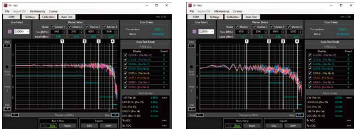
When measuring the master cable

You can check the frequency characteristics, TMD5 line, and control lines on one screen.