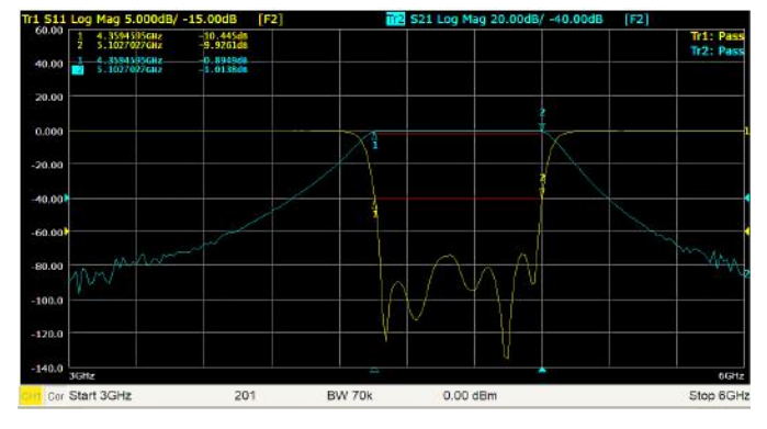
Passive Component Evaluation and Test

When integrated into balanced circuits with multiple input and output ports, these devices introduce complexities in measurement system setups. The primary challenge in testing these devices lies in obtaining precise data swiftly and efficiently.