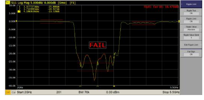
Ripple Limit Testing

The BNA100 series simplifies these tests by providing six limit line segments to be defined for each displayed plot. A visual alarm will be shown when a limit line is crossed.