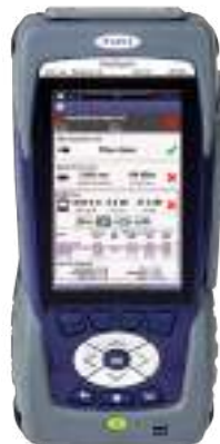
OneCheck Fiber Result view on ONX