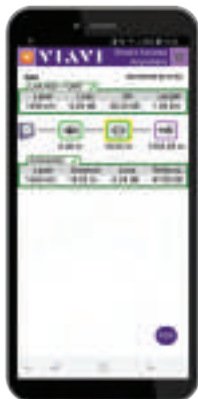
SmartAccessAnywhere Result view on a smartphone

The summary view of results gives a clear pass/fail status of the optical link, while the Smart Link Mapper (SLM) icon-based representation provides in-depth information about each passive optical network element.