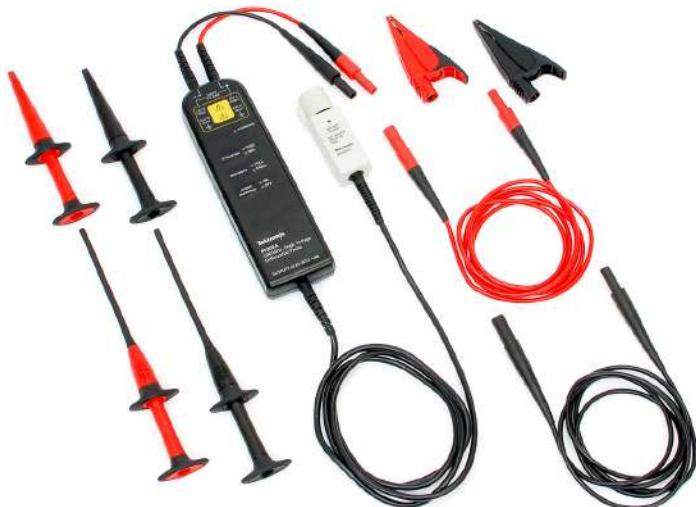
The P52xxA Series probes provide high-voltage differential measurement solutions for any oscilloscope.