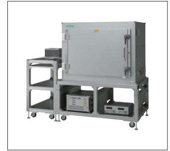
RF Chamber MA8171A