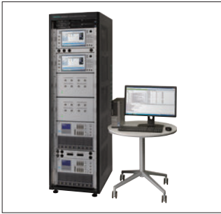
LTE-Advanced Mobile Device Test Platform ME7834LA