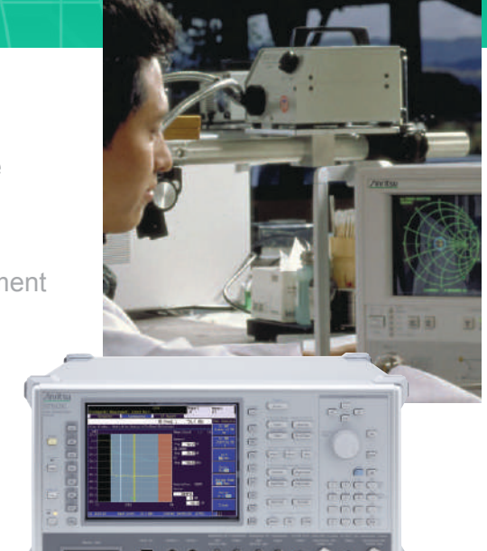
MT8820C Radio Communication Analyzer

Our service agreement prices are locked in so you know your exact product lifecycle maintenance costs. Plus, if you purchase a Repair Agreement or Full Service Agreement within 30 days of a per-incident service, you are eligible to receive a 25% discount.